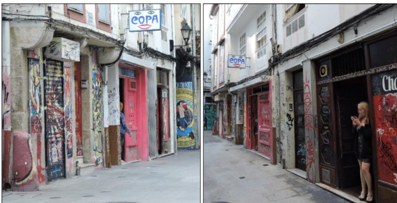
Figure 3. Brothels in Orzán.

Modern facilities coexist with brothels in decline (see Figure 3). These survive in some inner alleys between Orzán Street and San Andrés Street. This visual clash between affluence and mixed commercial activity delimits the border between Orzán and Peixarria. Despite being besieged by trendy and ‘creative’ establishments, brothels remain somehow invisible to the pedestrian and vehicular traffic along both streets.