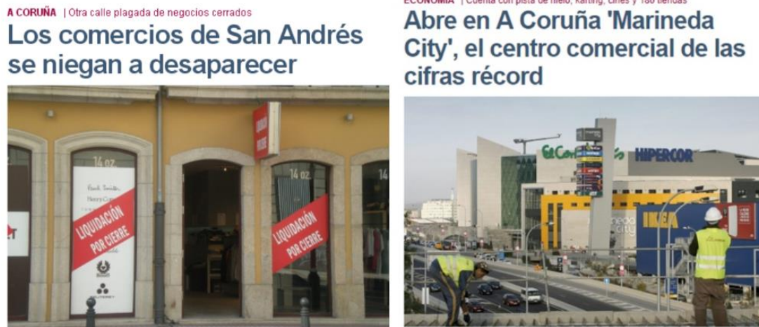
Figure 4. News from the Newspaper El Mundo . Source: www.elmundo.es (09/07/2010 and on 04/14/2011). Caption: Left: ‘Shops in San Andrés refuse to disappear’ Right: ‘Opening in A Coruña of ‘Marineda City’, the commercial centre of the record figures’. Since the beginning of the decade, while the traditional shops in Orzán disappeared, on the outskirts of A Coruña and its metropolitan area, important networks of shopping centres were built.

In short, the commercial gentrification of Orzán, as in other large Spanish cities 4 , mimics the neoliberal patterns of the city as an ‘entertainment machine’ (Lloyd and Clark 2001), which thematise the urban centre for two large global audiences: the creative classes and tourists.