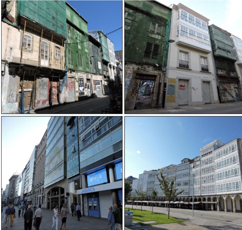
Figure 1. Visual contrasts between Orzán and Peixarúa (A Coruña).

Caption: Top Row: Degraded buildings on an Orzán street alongside a recently renovated one. Bottom Row of the most emblematic and tourist areas of the neighbourhood of Peixarúa.