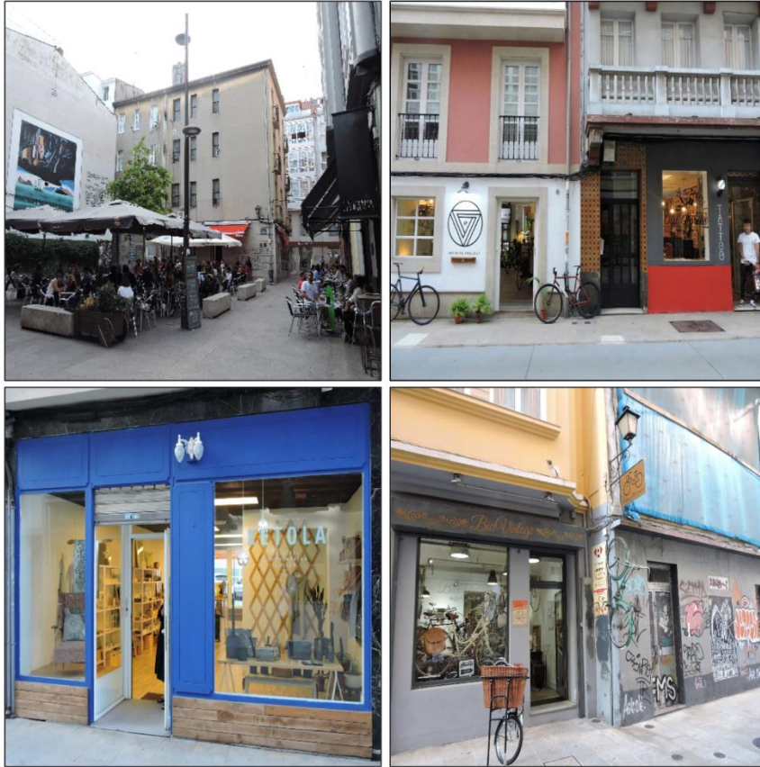
Figure 2. Examples of Local Businesses — ‘Hipsters square’ surrounded by trendy establishments (above left); vintage bicycle repair shop and barbershop/hipster tattoos (above right); Scandinavian design furniture shop (below left); vintage bicycle shop (below right).

Modern facilities coexist with brothels in decline (see Figure 3). These survive in some inner alleys between Orzán Street and San Andrés Street. This visual clash between affluence and mixed commercial activity delimits the border between Orzán and Peixarria. Despite being besieged by trendy and ‘creative’ establishments, brothels remain somehow invisible to the pedestrian and vehicular traffic along both streets.