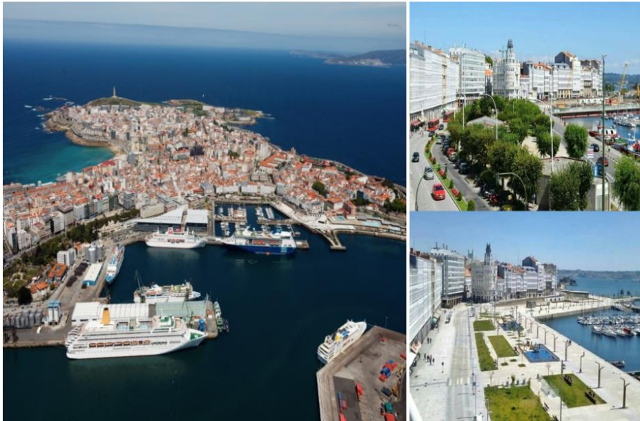
Figure 5. Coastline and seafront of the historic centre of A Coruña. Caption: General view of the city with six anchored cruises (left) and comparison between A Mariña before (upper right) and after (bottom right).

Privatisation of the coastal area has increased touristic pressure on the historic centre and consolidated the current processes of upscale development and gentrification. Although the most direct impact occurred in the neighbourhoods of Peixaría and Cidade Vella, which largely shape the affected coastline of A Coruña, Orzán is also changing due to the real estate speculation generated by the transformation of the entire southern coast of the city.