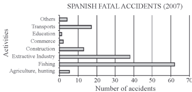
Fig. 3. Fatal accidents in Spain in 2007 year by activities - for one hundred thousands of Workers (obtained from [3])

higher than in merchant shipping [2, 3]. Nonetheless, there are a relevant percentage of accidents taking into account the number of Spanish merchant ships [1]. Therefore, seafaring is often the second most hazardous occupation after commercial fishing in advanced western countries.