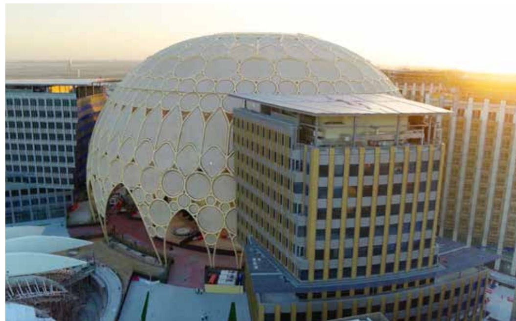
Computer technology allows greater architectural exploration in Expo structures such as the Vanke Pavilion at Expo 2015 Milan (top left), Nur Alem at Expo 2017 Astana (top right) and Al Wasl Plaza at Expo 2020 Dubai (bottom)