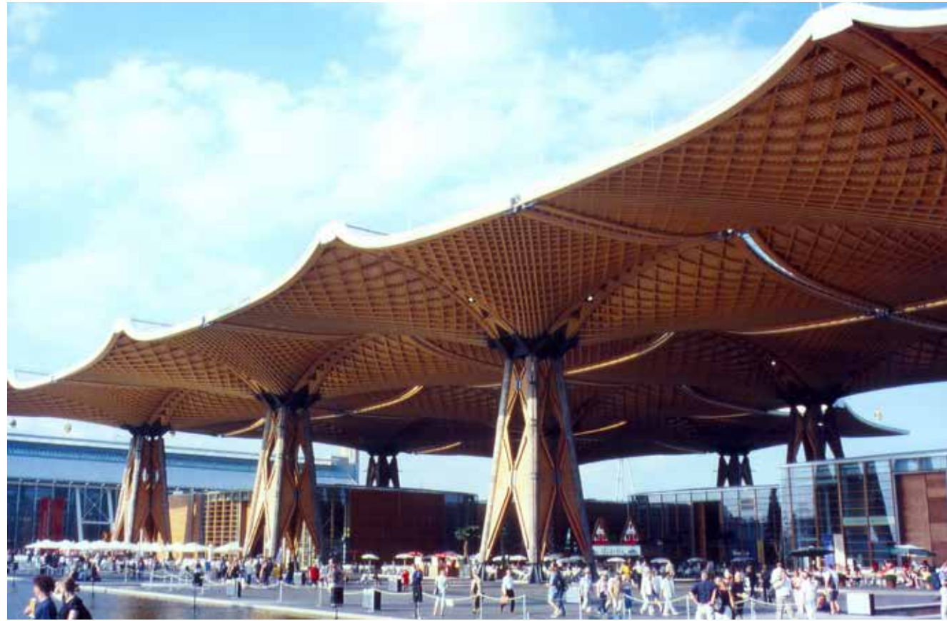
BUREAU INTERNATIONAL DES EXPOSITIONS (BIE)