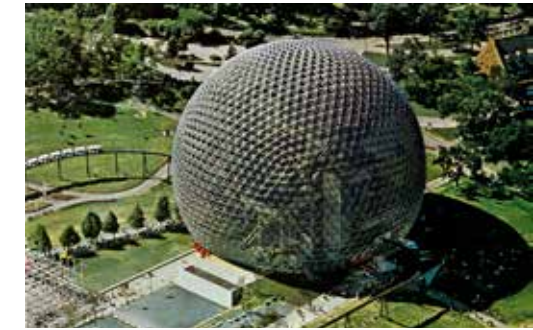
© BUREAU INTERNATIONAL DES EXPOSITIONS (BIE)