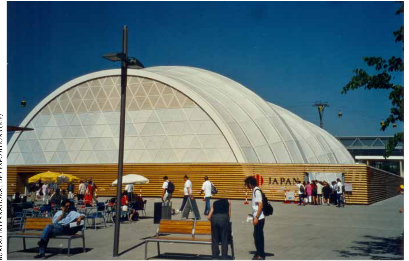
BUREAU INTERNATIONAL DES EXPOSITIONS (BIE)