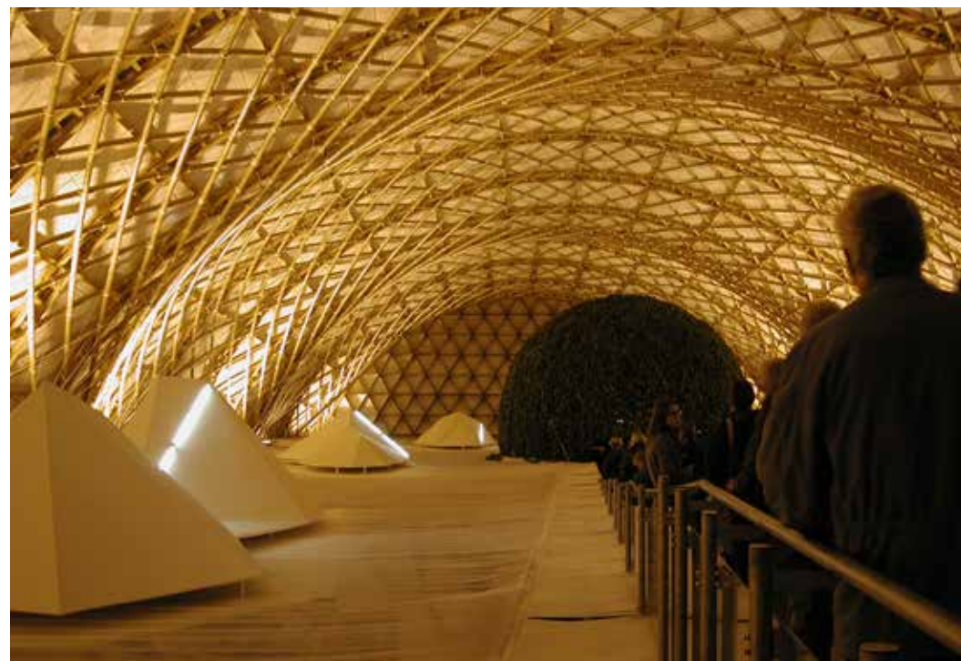
BUREAU INTERNATIONAL DES EXPOSITIONS (BIE)