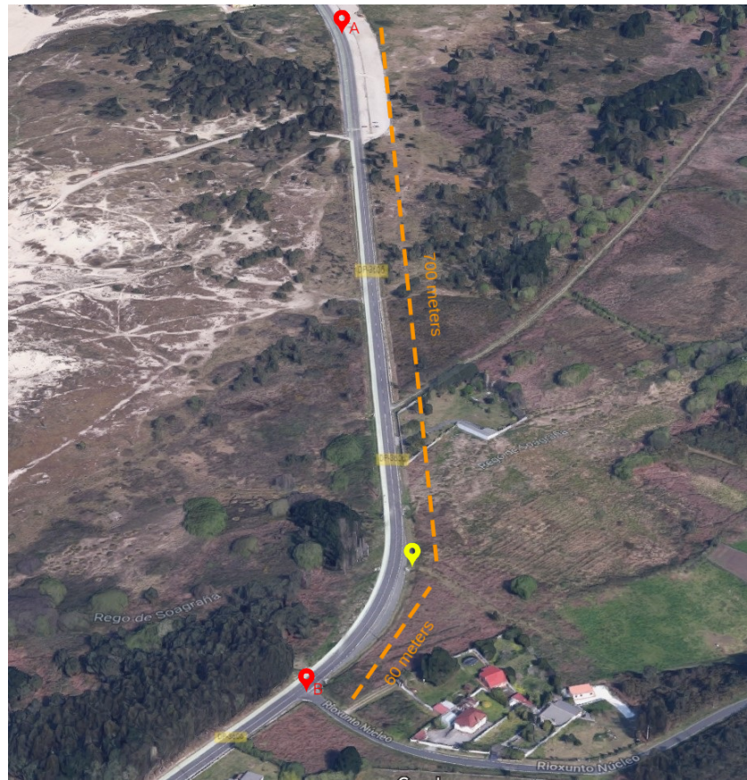
Figure 2. Testing scenario.