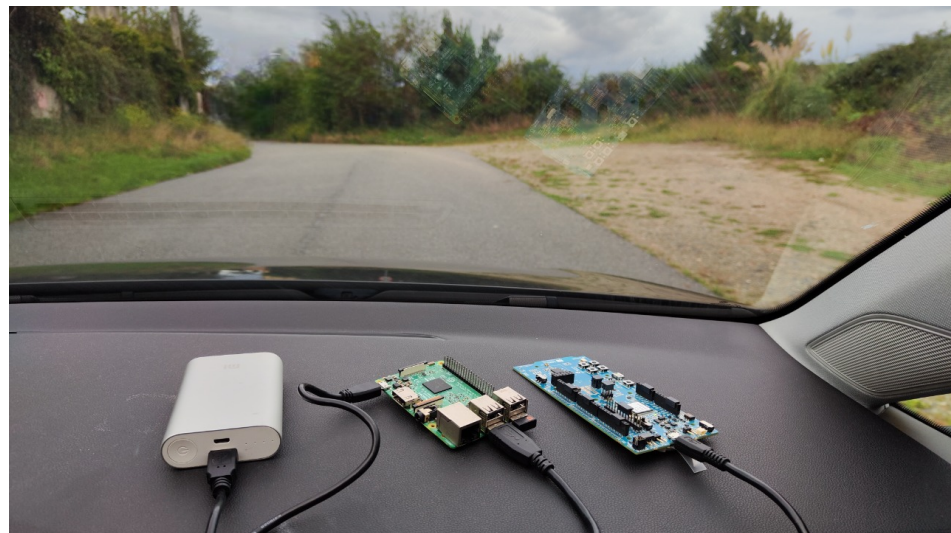
Figure 3. IoT node inside the vehicle in the test scenario.