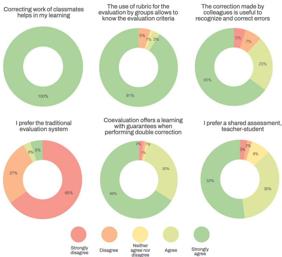
Figure 3. Results of the satisfaction survey carried out (total values).

Figure 3 shows the results obtained in the surveys carried out on students during the last 5 years.