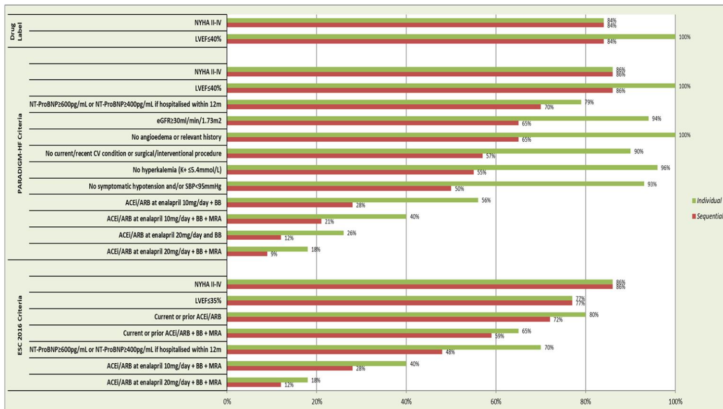
Figure 1. Fulfilment of (A) drug label, (B) 2016 ESC guidelines on heart failure and (C) PARADIGM-HF criteria for sacubitril/valsartan (LCZ696) eligibility among ESC-EORP-HFA HF-LT Registry heart failure with reduced ejection fraction outpatients: individual and sequential impact of criteria. Proportions of 28% and 12% for both PARADIGM-HF and ESC guidelines represent the main findings based on requiring 10 or 20 mg enalapril daily, respectively. ACEi, angiotensin-converting enzyme inhibitor; ARB, angiotensin receptor blocker; BB, beta-blocker; CV, cardiovascular; eGFR, estimated glomerular filtration rate; LVEF, left ventricular ejection fraction; MRA, mineralocorticoid receptor antagonist; NT-ProBNP, N-terminal pro-B-type natriuretic peptide; NYHA, New York Heart Association; SBP, systolic blood pressure.