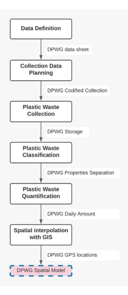
Figure 2. Study methodology undertaken.