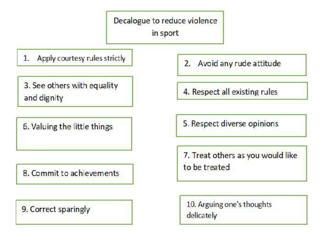
Figure 1. Decalogue to reduce violence in sport

The essential competences are those which allow adolescents to go on to succeed in any area of life, including (a) behavioral, such as learning to listen, expressing one's point of view or waiting one's turn to speak, (b) cognitive, such as decision-making and commitment, (c) physical, such as scoring a goal. Figure 1 shows a decalogue to reduce violence in sport.