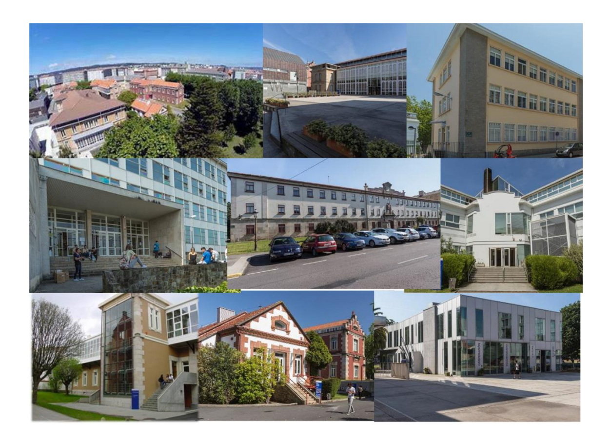
Plate 1. Ferrol campus buildings

Ferrol campus is a peripheral campus belonging to the UDC, a public institution of higher education and research located in the Northwest of Spain. Located in the third urban concentration of Galicia, the campus has six schools, totaling 11 undergraduate, 7 master's and 6 doctoral programmes. The campus is divided into two parts: the Polytechnic University School, outside the city and the main campus of Esteiro, installed among 67 tree species from a botanical garden in rehabilitated buildings of the former Navy Hospital (Plate 1).