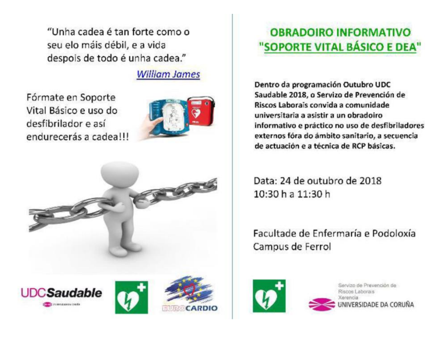
Figure 1. Workshop with AED

The UDC Health Office organized several events related to healthy living for the entire university community and the general population at the campus such as: