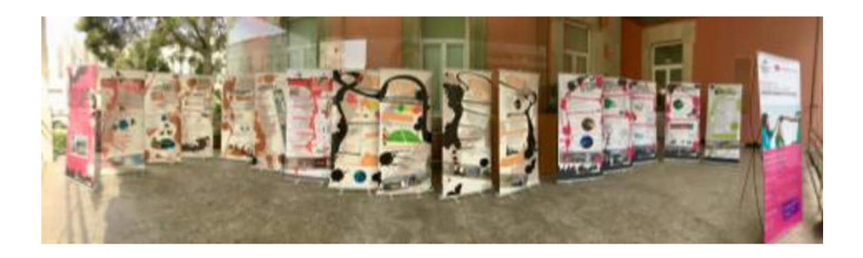
Plate 6. Photograph of the exhibition in the main hall

All the results presented here make up the report sent to the Association for Environmental and Consumer Education (ADEAC). This entity reviewed the campus actions, visited the Campus to conduct an external audit and awarded us the Green Flag. Table 6 shows the list of evidence presented to ADEAC as a justification for the actions carried out on the Campus.