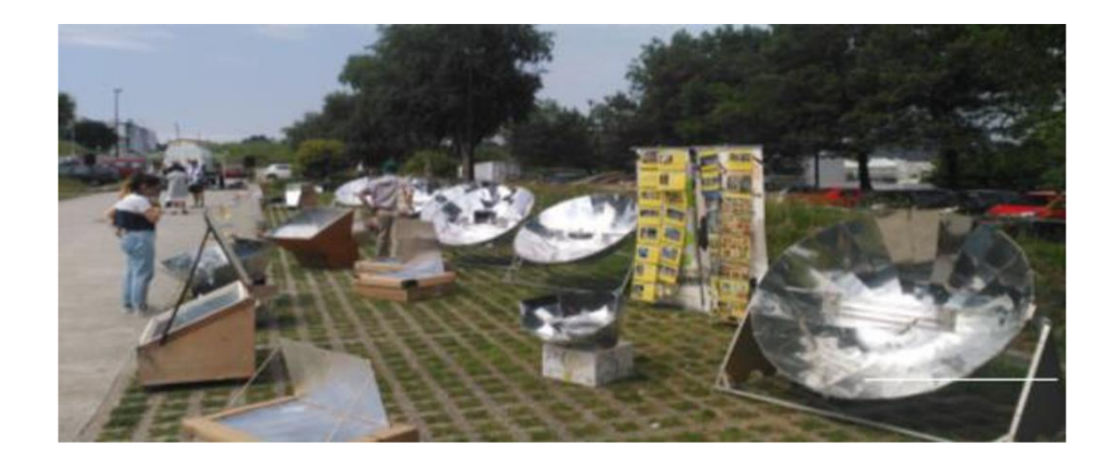
Plate 4. Solar cookers