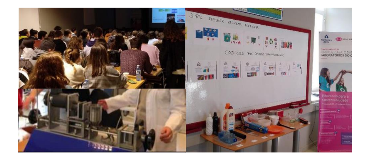
Plate 3. Photographs of conferences

"Sustainability and green job sites". The lecture introduced listeners to the current change in the ways of producing, distributing and consuming, as well as new opportunities for "green jobs".