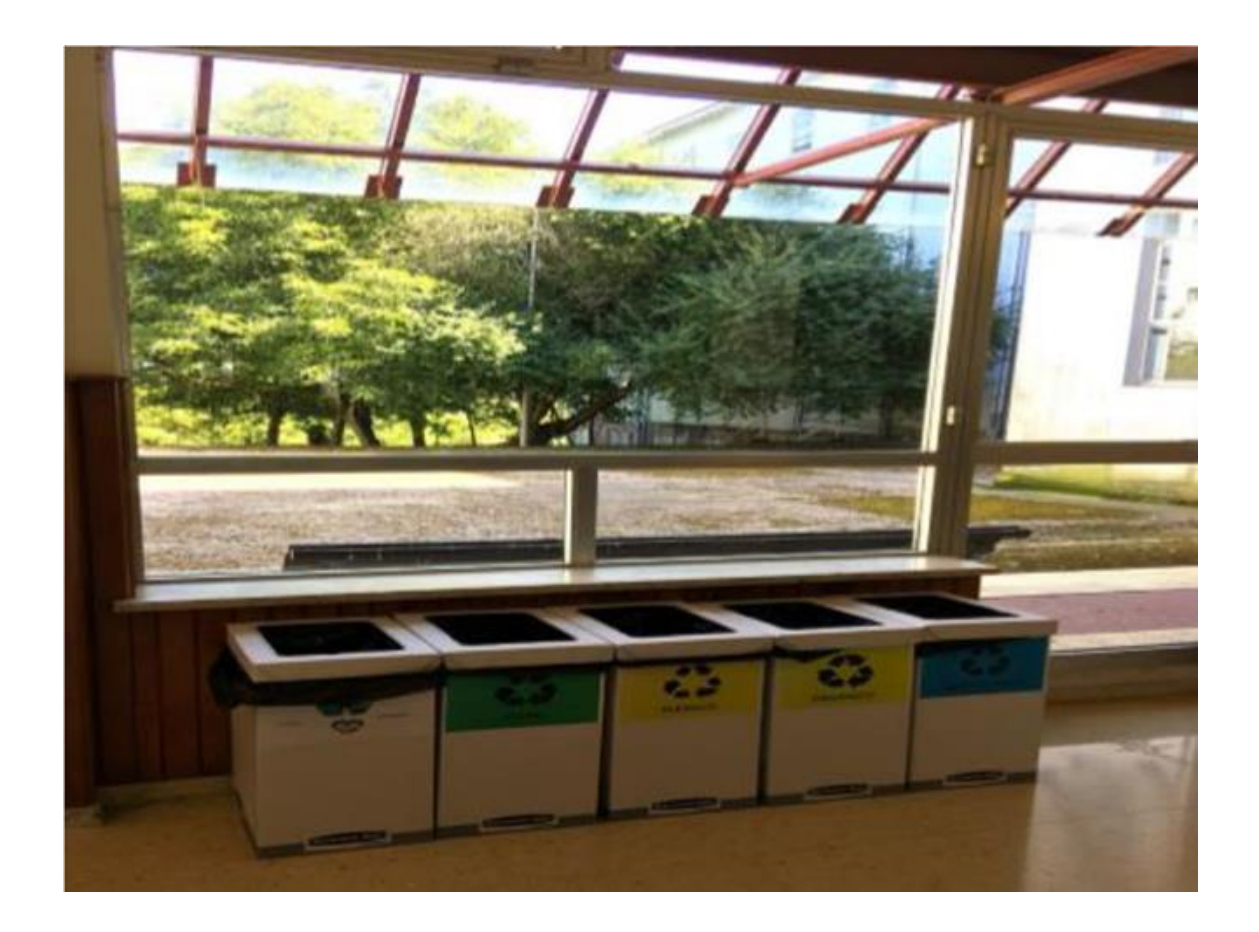
Plate 2. Recycling bins

Several training and awareness-raising actions and activities in waste management were carried out: