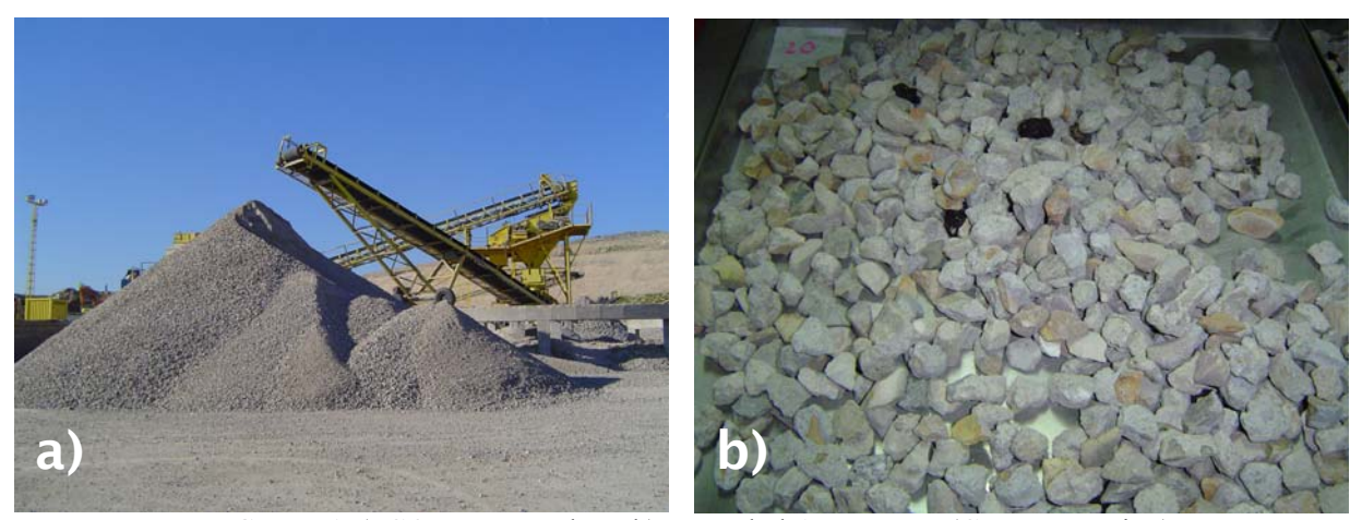
FIGURE 1 a) C&D Waste Plant, b) Recycled Aggregates (Coarse Fraction)

the removal of pollutants, sieving and classification of the aggregates and washing. In this sense, an RA production plant is very similar to an NA crushing plant. It is equipped with crushers, sieves, conveyor mechanisms, equipment for pollutant removal and electromagnets to separate the steel.