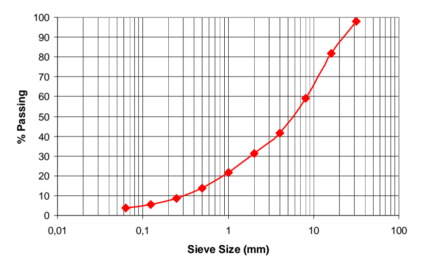
FIGURE 2 Grading curve of RA