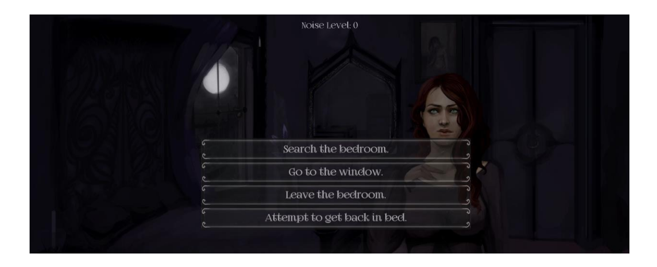
Figure 4: Ebon Light exploration menu