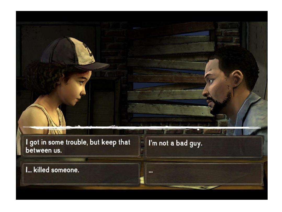
Figure 3: Clementine and Lee from The Walking Dead Season 1