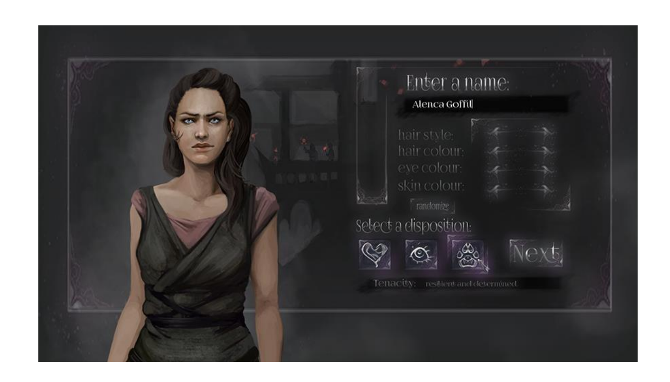
Figure 5: Customization of main character