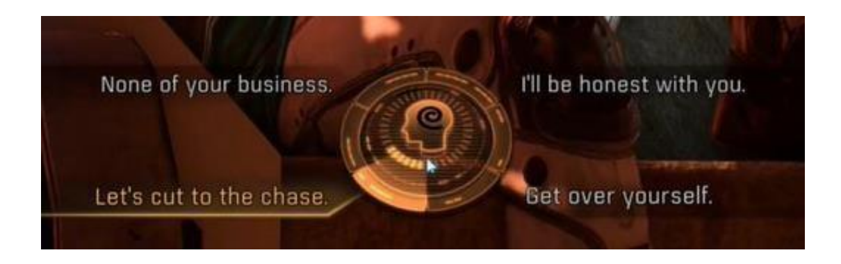
Figure 2: Dialogue choices from Mass Effect: Andromeda