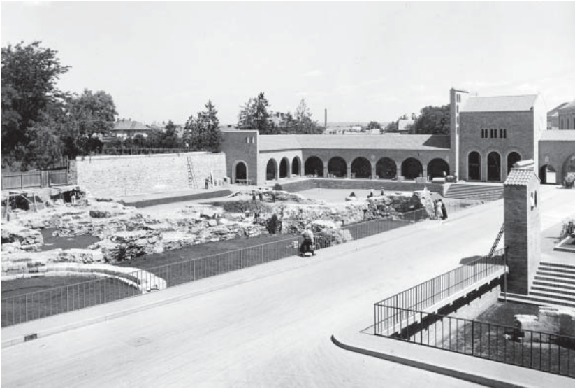
Fig. 06. Foundation walls of the excavated basilica, ruin garden, Székesfehérvár (Hungary), 1936. Fig. 07. János Sedlmayer, St. Michael the Archangel Roman Catholic Church, Tar (Hungary), 1978-84; reconstruction.