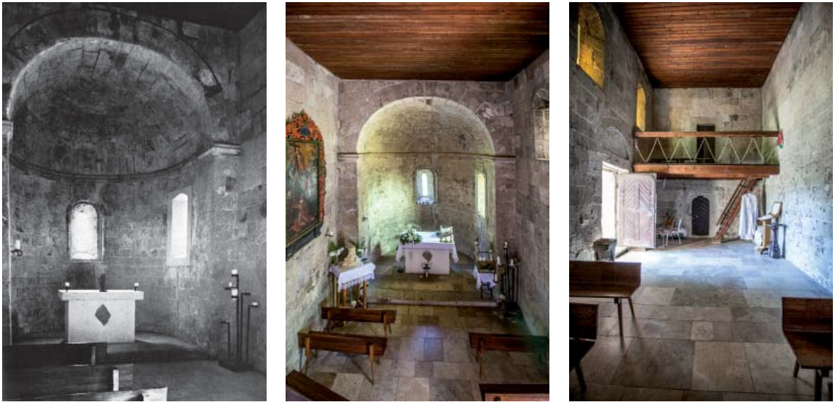
Fig. 09. St. Stephen's Roman Catholic Church, Nagybörzsöny (Hungary). Architectural restoration plans: Ferenc Erdei, Zsuzsa Sedlmayrné Beck, 1966-67; archaeologist: Ida Romhányiné Ratkai.

(Somorjay 2019). It is important to note, however, that already in 1918 Guardini warned the proponents of liturgical renewal that the purpose is not the new aesthetic, but the renewal of the spirit with the help of the new aesthetic (Guardini 1997). 2