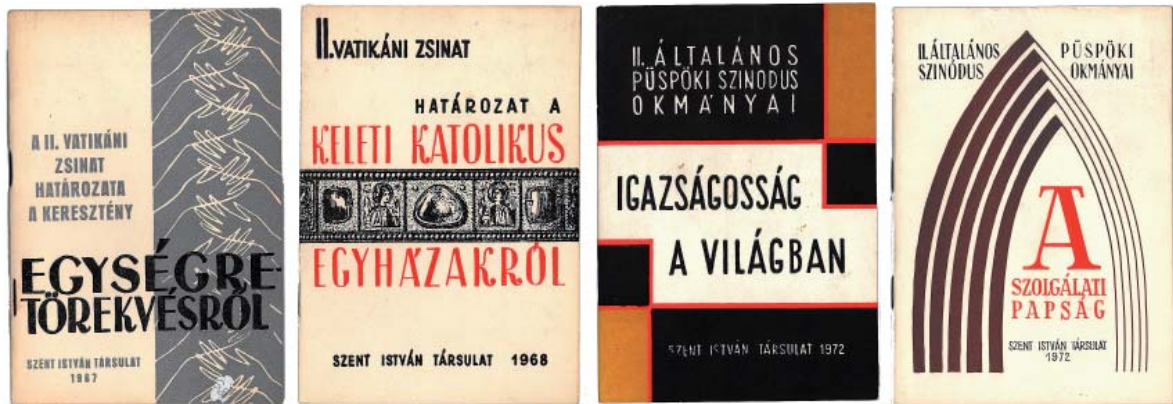
Fig. 01. The Hungarian translations of the Vatican II documents published as little booklets by St. Stephen's Society, 1966-88.