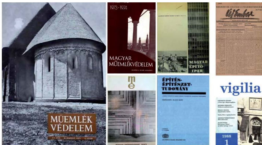
Fig. 08. Major monument protection and architectural journals and periodicals of the Roman Catholic Church.

buildings and strive for distinctive character in subsequent additions was uniformly positively judged in the period between the two world wars (Marosi 2019). The archaeological research and reconstruction of great national importance (in Esztergom and Székesfehérvár), scheduled already for the double holy year of 1938, far advanced the professional aspects of the later Venice Charter (Fig. 05–06). Based on this, the embeddedness of the charter in Hungarian practice was well justified before its establishment. The protection of 20th century monuments was defined by charters that sought to have a unified, international impact. The Venice Charter in Hungary essentially confirmed the high-quality domestic practice between the two World Wars. Over time, however, the modernity of the charter has become inseparably linked with distinctiveness and often to the pursuit of architectural didactics (Zsembery 2015). In the second half of the 20th century, most of the restorations, structural and spatial reconstructions —affecting also historic sacred buildings— considered the spirit of the charter as a general reference (Fig. 07).