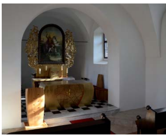
Fig. 13. St George, Zagreb (Croatia), 1729; new intervention by Siloueta architecture (2015). Fig. 14. St George, Zagreb (Croatia), 1729; detail of new sanctuary (2015).