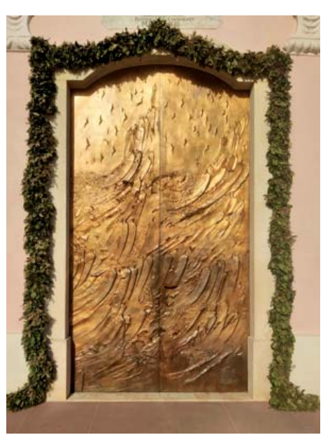
Fig. 09. Cathedral of Saint Teresa of Ávila, Požega (Croatia), 1754-73; intervention in 2007.

Fig. 10. Cathedral of Saint Teresa of Ávila, Požega (Croatia), 1754-73; new doors by Marija Ujeviæ Galetoviæ (2017).