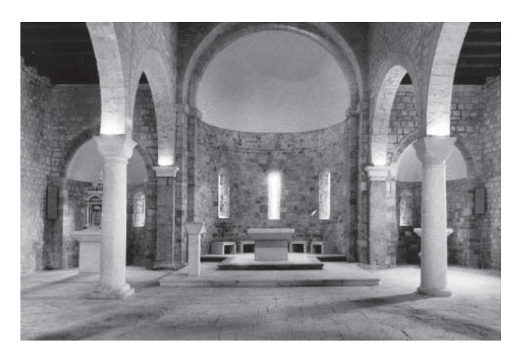
Fig. 06. St Quirinus, Krk (Croatia), 12th century; intervention in 1985. Fig. 07. Cathedral of St Stephen I, Hvar (Croatia), 14-17th centuries; new doors, 1987-90 Fig. 08. Cathedral of St Stephen I, Hvar (Croatia), 14-17th centuries; new altar, 1990-93