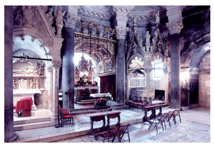
Fig. 02. Friedrich von Schmidt, Cathedral of the Assumption of Mary, Saint Stephen and Saint Ladislaus, Zagreb (Croatia), 1880–1906; interior.

Fig. 03. Cathedral of St Domnius, Split (Croatia), 4th century and ss; intervention after Second Vatican Council.