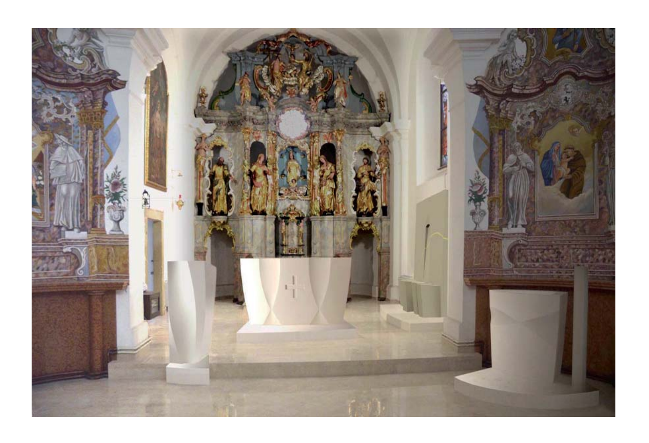
Fig. 11. Assumption of the Blessed Virgin Mary, Zagreb (Croatia), 1756; new intervention by Siloueta architecture (2015).