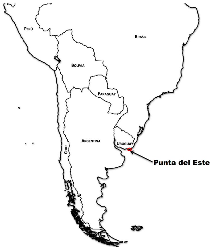
Figure 2. Geographical location of Maldonado-Punta del Este.

The sample was obtained by personal interview, while sampling for convenience but controlling various socio-demographic parameters to avoid significant biases in the resulting profile. The information was collected between February and September 2016. We carried out the field work over several months to avoid biases due to the seasonality of tourist activity. The questionnaires obtained were reviewed to verify that they were not incomplete or poorly answered. If any of these problems were detected, the questionnaire was discarded. The final sample consisted of a total of 420 valid questionnaires, in which the demographic parameters were tested to avoid bias. Table 1 shows the socio-demographic profile. The margin of error is of 4.88%, with a 95% confidence level. This investigation uses a causal model, in which responses are collected using a 5-point Likert scale (1 “totally disagree” to 5 “totally agree”). These scales come from previous studies and previous work of the authors [5,75,81,83,129–131,136,137].