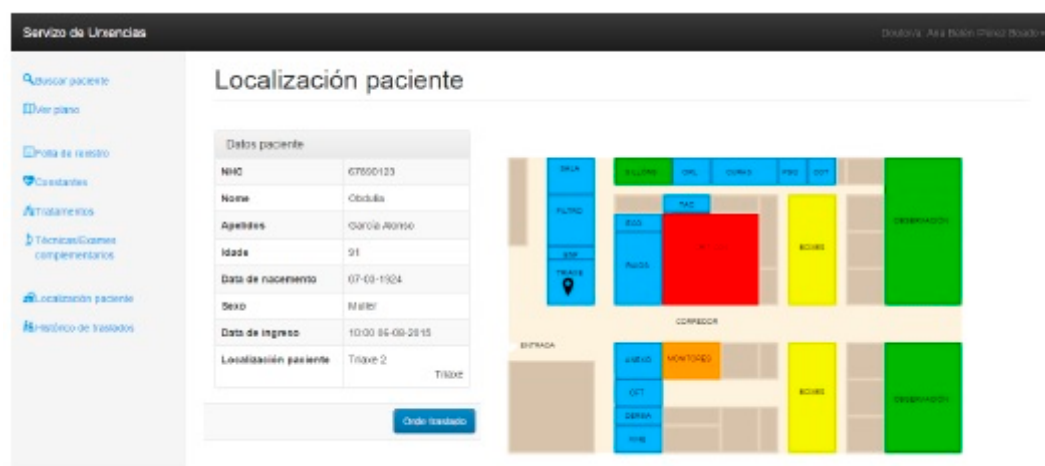
Figure 5. Emergency services area map for data acquisition and patient location.

Following its development, the application was considered as complete, given that it complied with the functional requirements previously described. The application was tested with unit and system tests and also functionally by health professionals involved in the project. It was tested directly by at least one specialist representing each professional profile involved in this project, whose contribution was essential for the successful outcome of the work.