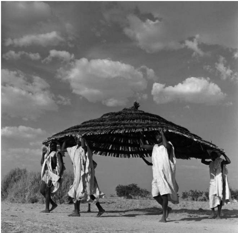
Fig. 02. Men leaving Kano market (Nigeria) carrying their latest purchase: a new roof for their house, 1951.