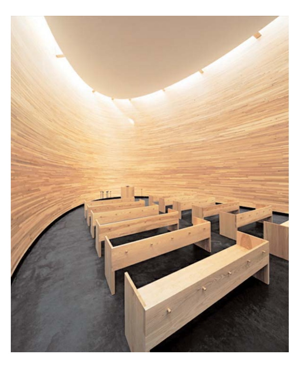
Fig. 03-06. K2S architects, Kamppi Chapel of Silence, Helsinki, 2008/12.