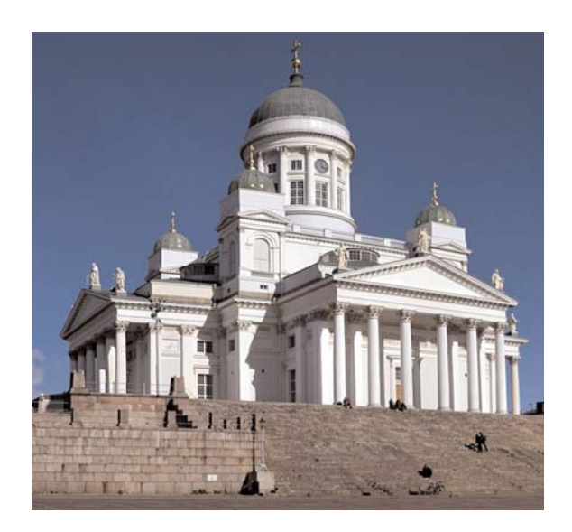
Fig. 01. Carl Ludwig Engel, St. Nicholas Cathedral, Helsinki, 1830/53.