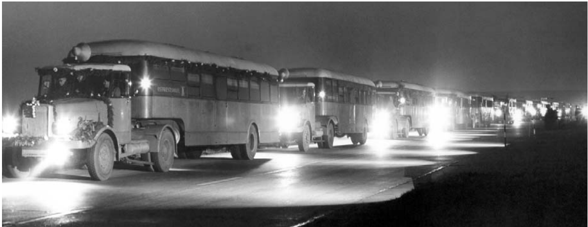
Fig. 07. Exodus of the chapel trucks from Königstein. Father Van Straaten is seeing the vehicles off, 18 April 1955. Note the photographer to the right.

communism had no monopoly on virtues such as solidarity and charity. These ideological undertones turn explain to a certain extent why this action was staged with such care. The blessing of the vehicles in Königstein on Easter Day for example resembled much the departure of a motorized crusade and was recorded in numerous photographs, published with ominous captions such as «These churches on wheels must fill even the worst enemy of faith with awe» 21 (Fig. 06-08). Such heroism and techno-morphic imagery added to mythologizing the chapel trucks as the harbingers of a modern form of Catholicism.