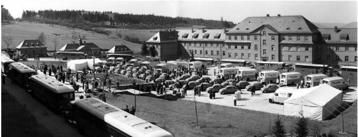
Fig. 08. A convoy of chapel trucks on the autobahn on their way to Königstein, 1951.

places of worship at the crossroads of flows of people such as train stations, airports, ski resorts, camping sites and even Mediterranean beaches. Flexible, ephemeral and elementary in their conception, such churches did away with the idea that true worshipping required a monumental structure firmly rooted in the ground. It could be argued that EPRO put into practice this idea long before it became almost a doctrine in the context of Vatican II. Indeed, the chapel trucks anticipated a fundamental paradigm shift in pastoral care which would reach its most outspoken emanation in the Inflatable Church by Hans Walter Müller in 1969 24 . Made out of plastic and conceived to be transported to where it was needed, it would have fitted in the luggage of the ruck-sack priests , enabling them to fully accomplish their mission, in other words: to literally bring the church closer to the people.