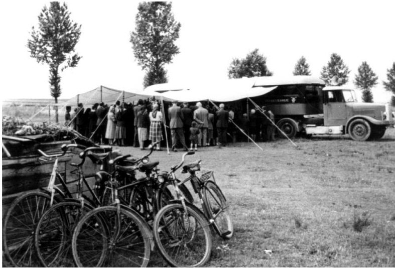
Fig. 03. Chapel truck in Belgium, 1951.

movement of Deinze (nearby Ghent) financed a truck of its own, baptized St. Popo in honour of its patron. Such acts of unselfishness were extensively covered in both the local press and EPRO's bi-monthly bulletin, Echo der Liefde (The Mirror). Published in seven languages, this magazine formed the cornerstone of EPRO's propaganda machine, bearing the typical characteristics of this type of publications: an insistent tone, heroic accounts of recent achievements, catchwords in large characters and dramatic images documenting the miserable fate of fellow Catholics 12 (Fig. 04). The periodical reflected Van Straaten's gift for capturing the general public's imagination – the most notorious instance being his epithet Bacon Priest which became a household name in Flanders 13 . With a readership of almost 700.000, he headed, as he pleased to state, one of the largest parishes of the Catholic world.