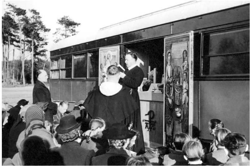
Fig. 02. Celebration of the mass at one of the chapel trucks. Date and location unknown.

Straaten's appeal triggered an impressive wave of generosity, especially amongst the country people and traditional-minded Catholics in Belgium and Holland. Van Straaten therefore set up a structure through which material and financial aid could be sent to Germany. The organization, called Oostpriesterhulp (Eastern Priests Relief Organization, EPRO) grew at an extraordinary pace and established its headquarters in the seminary for expelled clergy at Königstein, near Frankfurt 5 .