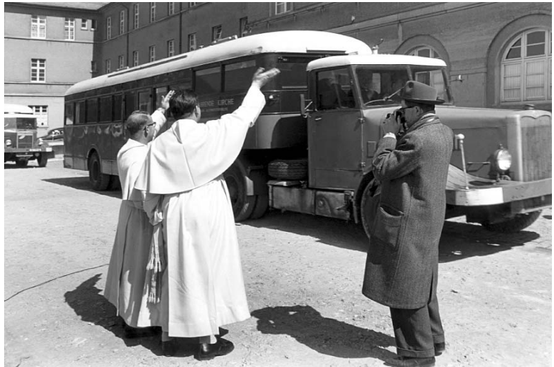
Fig. 06. Blessing of the Chapel truck fleet prior to departure in Königstein. Date unknown.

their circumscription was seen as proof of its efficiency. Moreover, Pope Pius XII himself had expressed his approval and enthusiasm in a letter to the German episcopacy 15 . In fact, however, this letter was also meant to stifle slumbering criticism from other charities such as the venerable Bonifatius Werk . Its director stated that EPRO's actions were arbitrary and ill-considered, while others claimed that its large turnout had first and foremost to do with the novelty and spectacle of the trucks and the free distribution of food and clothing 16 . As a matter of fact, towards the mid-1950s, the expellees too started to benefit from the German Wirtschaftswunder (Economic Boom): most found employment while the increasing standard of living became clear, for example, in the great number of churches that arose everywhere. The focus of the chapel truck action shifted accordingly: as it appeared that a growing number of people were leaving the Church, the action concerned no longer only the rootless expellees but all German Catholics. Consequently, sustaining adherence to the church became the new challenge 17 . To this effect, the missions now halted longer in one place in order to allow a more in-depth approach. The chapel truck action thus became a particular type of Volksmission , complementary to the existing pastoral care in specific areas. Finally, in 1970 the campaign was officially ceased. Some trucks were kept for promotional goals while the rest was shipped to