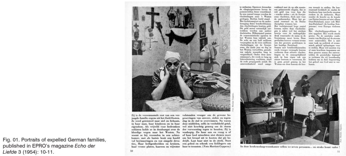
Fig. 01. Portraits of expelled German families, published in EPRO's magazine Echo der Liefde 3 (1954): 10-11.