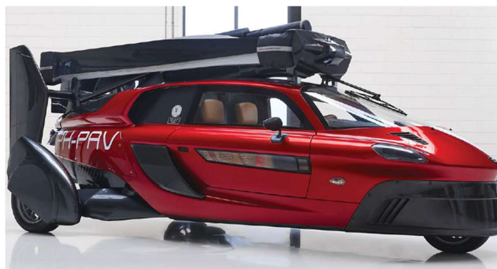
Figure 4. The Dutch Pal-V Liberty flying car [90].

Several enterprises work on flying cars, whose aesthetic recalls Spinners [89]. Indeed, current prototypes include vertical take-off and landing (VTOL) aircrafts or drones made of lightweight but resistant materials and with improved power density engines. The first commercially available flying car, the Dutch Pal-V Liberty, can already be reserved (Figure 4). It was presented at the Geneva Motor Show 2018. According to its developers, it takes 5–10 min to change from a three-wheeled car to a gyroplane and reaches 160 km/h on the road and 180 km/h in the air, at a maximum height of 3500 m. For its part, Uber plans to launch an aerial taxi service in 23 cities across 13 countries by 2020. Other firms, such as Google (with the start-up Zee.Aero) or Airbus (Vahana), are behind similar projects. Flying cars attract governments as well as traditional car manufacturers. Dubai plans to introduce a flying taxi at the World Fair in 2020, whereas Toyota supports a group of Japanese inventors to launch a flying car (SkyDrive) by the 2020 Summer Olympics in Tokyo.