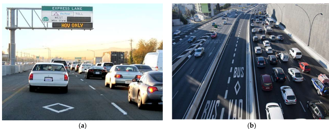
Figure 2. Dynamic versus static high-occupancy-vehicle (HOV) lanes: (a) adjacent HOV lane; (b) segregated HOV lane.

Take as an example the high-occupancy-vehicle (HOV) lanes, in which only vehicles with a predefined minimum number of passengers are allowed (generally HOV 2+ or HOV 3+). They are becoming more and more common in metropolitan freeways, with the objective of increasing the vehicle occupancy and promoting collective transportation and car-pooling. However, their effectiveness depends on their configuration [31]. It has been proven that in order to maximize their benefits, HOV lanes should be ordinary lanes that turn into HOV lanes only when necessary (Figure 2a). This configuration does not require huge investments, it can be easily implemented, and provides high flexibility in the operation of the HOV lane. Additionally, as a side result, it also smoothens and improves traffic throughput in the adjacent general-purpose lanes (i.e., the so called "smoothing effect"; see [32,33]). Nevertheless, HOV lanes are sometimes built as segregated and exclusive lanes that are isolated with concrete barriers or even run on a specific infrastructure (Figure 2b). In these configurations, it is difficult to adapt the operation of HOV lanes to different traffic conditions due to the limited spatial accessibility.