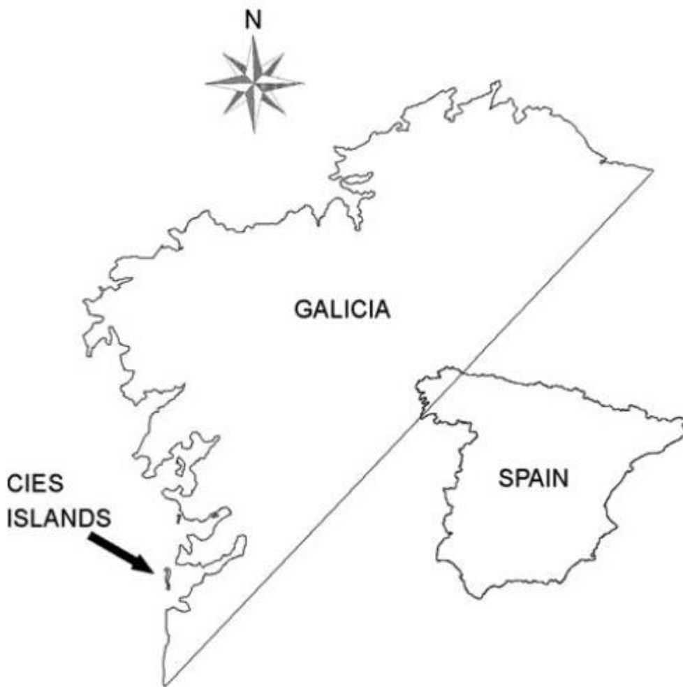
Figure 1. Location of the natural bed of razor clams Ensis arcuatus in Cies Islands (Galicia, north-western Spain).

In November 2002, the 'Prestige' oil tanker was wrecked 120 miles off north-western Spain spilling about 63,000 tons of heavy fuel oil (Figueras et al. , 2005). The spill affected a great extension of shores and a thick deposit of fuel arrived at the marine bottoms that Ensis arcuatus inhabits, affecting the Cies Islands extensively. The effects of an oil spill can differ among species. For instance, the 'Erika' oil spill produced a high mortality in sea urchins (Barillé-Boyer et al. , 2004), while no measurable effect was found in dolphins and seals (Ridoux et al. , 2004). Previous studies on the effects of oil spills on Ensis showed high levels of mortality after the wreckage of 'Torrey Canyon' (Smith, 1968) and 'Braer' (Glegg & Rowland, 1996) in Great Britain, and the 'Amoco Cadiz' in Brittany (Southward, 1978), and it is considered to be a species very intolerant to the presence of hydrocarbons in the water. Therefore, it is possible that the 'Prestige' oil spill could have affected populations of razor clams.