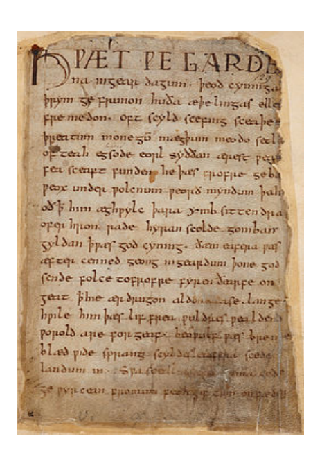
Image 4: Beowulf. Manuscript. Britsh Library Cotton MS Vitellius A.XV, f.132.

Beowulf was copied into the Cotton Manuscript (British Library, London) by two different scribes. Image (4) above shows the first page of the poem written in the West Saxon dialect of Old English. The first hand is typical of the late 10<sup>th</sup> century, whereas the other is closer of the 11<sup>th</sup> century. There is no evidence about who these copyists were, but we know that they were two and the second scribe began his work in line 1939, near the end of the first section of the poem. Both scribes have carefully proofread their copies and have made many corrections. Kiernan (1997: 171) affirms that the second scribe has even proofread the first scribe's work. There are some indications that show that two distinct texts of the poem were combined for the first time in the extant manuscript, and that many years after the manuscript was copied, the second scribe was still working on it (Kiernan, 1997: 171).