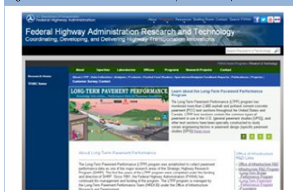
Figure 2. Screen shot from the LTPP Website

The Long Term Pavement Performance Database (LTPP, Figure 2.) constitutes one of the most important strengths of this method. It is the best data source of the field behavior of practically all the existing types of pavements under different load conditions, with different subgrades and foundations and in very diverse climatic zones. It has been created from general pavement studies (GPS), but also from specific pavement studies (SPS), expressly built to obtain some kind of information. Their combination allows the user to rely on data of more than 2,500 test sections, which are periodically updated and revised (Momin, 2011). Despite the power of this database, the accuracy of the results depends on the possibility of obtaining precise additional information of the construction area.