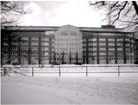
Police HQ Los Angeles, 2004