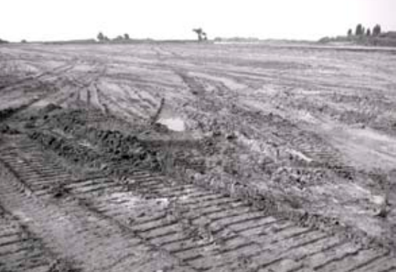
ECONOMIC RESEARCH ASS., MAIN OFFICE, LA, 2004