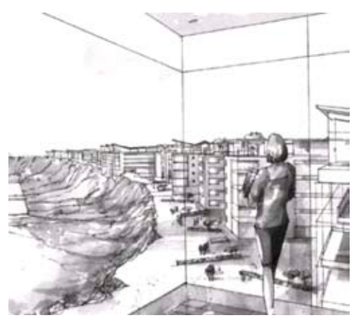
Architectural proposal, Kalkbrottet, South Malmö (Unsigned drawing in «The developer's dream come true...», folder, published by Heidelberg Cement, 2003)

The second type of influence, the transferable discourse, is brought in by the research team itself, and can be illustrated by the interest in exploiting open green spaces and recreation areas south of Malmö, where protests and actions against the local government of the City of Malmö (and its decision to let this area be turned into an area for housing and business) have taken place recently. This process may be analysed, and perhaps influenced, by a similar discourse in Los Angeles. Over a period of thirty years, a wetland area, Ballona Wetlands, in the southern part of the City of Los Angeles has been the subject of architectural suggestions (and protests), initially dominated by proposals in the spirit of New Urbanism, and later to be concretely manifested — as a simplified version of this current — in large scale housing developments known as the Playa Vista area.