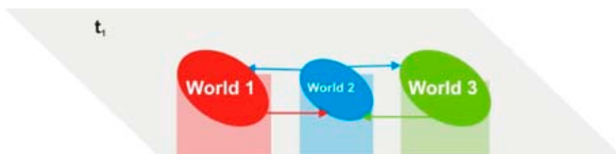
FIGURE 1 REPRESENT THIS MEDIATE RELATION BETWEEN WORLDS 1 AND 3, AND THE DIRECT RELATION BETWEEN WORDS 1 AND 2, AND WORLDS 2 AND 3.

Playing billiards is not just a matter of hitting the balls with the cue. We have to hit the right balls in a certain way that drives the proper balls to find their way to the pockets in the appropriate sequence. One can do it purely intuitively, other person taking advantage of long term practice, and even other one, who never had played billiards before and doesn't trust his own intuition, can decide to use a physical theory about linear momentum (a World 3 entity) to strike correctly the balls (World 1).