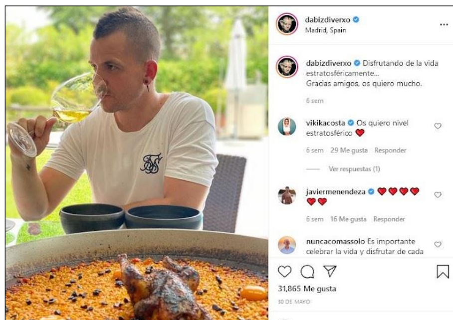
Figure A2. Image of the Instagram of the chef Dabiz Muñoz.