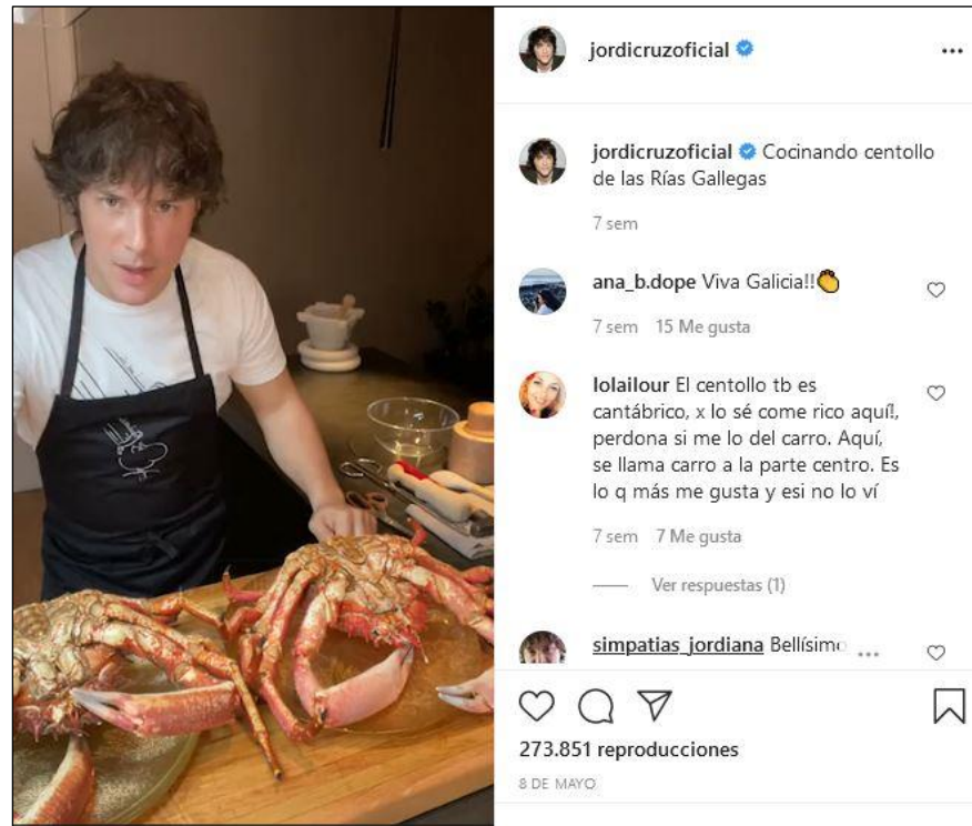
Figure A1. Image of the Instagram of the chef Jordi Cruz.

Stimulus materials were presented to research participants when the questionnaire was administered. The stimuli present two popular Spanish celebrity chefs recommending food products in their social media networks.