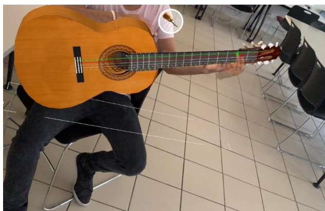
Figure 4. Example of task: Student performing the G chord.

were told they would be playing chords following the chord sequence listed in Table 1. They were also informed that they would learn through a training these chords by imitating a 3D model (Figure 4).