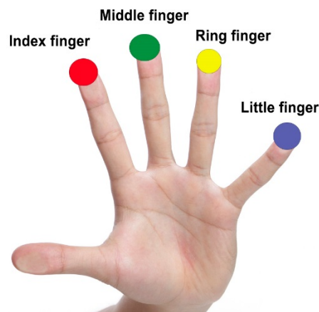
Figure 1. Distribution of colours by finger.

The focus of this research is on identifying whether AR facilitates training. In this case, whether it can help complete beginners train how to play chords on the guitar correctly by demonstrating correct finger placement. In using AR to create interactions between the real and virtual world it is possible to create a more interesting train experience, meaning that training can be delivered in an interesting and satisfactory way [23]. Taking this into account, the research team developed a 3D model of an acoustic guitar that is implemented in AR to display the neck and frets of the guitar. When building this model, the intention was to construct a tool that would allow any novice to identify the strings and frets that needed to be played for a particular chord. To achieve this, a static colour is assigned to each finger. Figure 1 below shows the distribution of colours by finger.