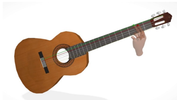
Figure 2. 3D model showing correct finger positions for the G chord.

Using this colour code, learners are instructed how to position fingers on the strings when playing any given chord. As there was a perceived risk that learners might quickly forget or confuse the colours assigned to each finger, researchers also modelled a semi-transparent 3D hand to indicate correct hand and finger placements. This hand was made semi-transparent for improved visibility. Figure 2 below shows how the G chord is rendered by the software. In this figure it is possible to discern both of the aforementioned elements, the colour code used for finger placements and the 3D hand.