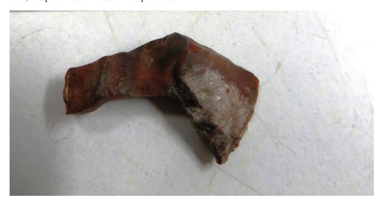
Fig. 2. Chert debitage debris showing heterogeneity.

a polycrystalline object and even indications of the presence of constituents with differences in terms of internal structure. However, its application to objects with irregular surfaces requires special care. X-ray diffraction is related to the arrangement of atoms in periodic structures and it could be useful for assessing whether the material is crystalline and even to identify the crystal substances present in raw material (if there are few different structures) or even test the presence of a given crystal substance.