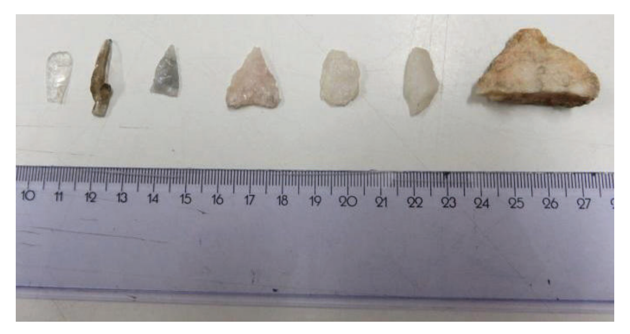
Fig. 3. Lithic artefacts made from quartz (colour variations can be used for a proposal of quartz typology).

parency), which will help to plan further analytical work (e.g., colour variations in minerals are frequently related to chemical variations; transparency variations can result of the presence of micro-inclusions). In Figure 3, we present a set of different lithic artefacts in quartz from our case study. Colour observations allow establishing a typology of quartz raw materials that can help in the definition of the set of potential sources.