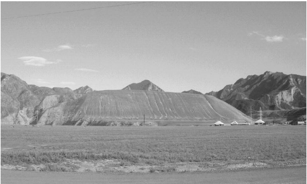
Photo 3. Megaflood terrace in the Altay. The entire terrace was formed as a result of single flood episode.