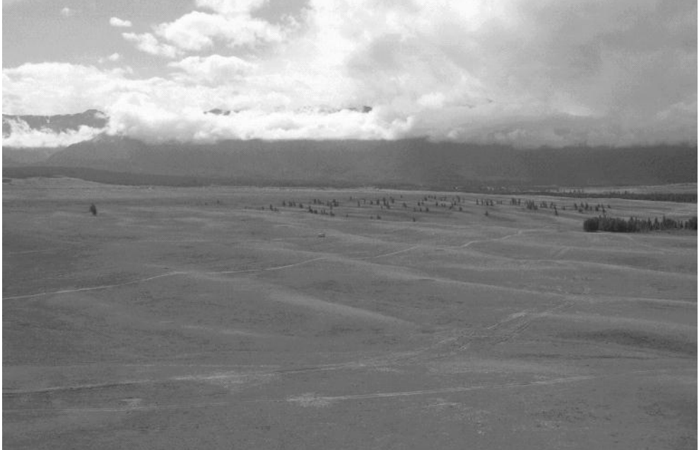
Photo 2. Giant ripples of ancient megaflood in the Altay. The height of ripples is up to 20 m.