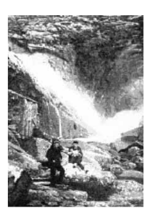
Photo 1.- ca. 1928 in Cadoiro do Ézaro, Geografía General del Reino de Galicia, Coruña Volume 1: 215.

"Ézaro River [Xallas River] or Lézaro, flows quickly among boulders not far from the sea between the beginning of O Pindo Mount and Santa Uxía do Ézaro (...); the place where it falls is called Cadoiro." (Sarmiento, Fr. M. 1745) (Photo 1).